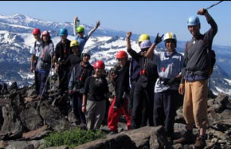
Shown here are participants in the Adventure-Risk-Challenge Summer Literacy & Leadership Program near Truckee, supported by Teichert Foundation.