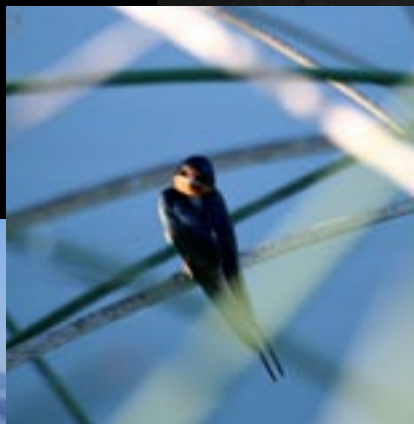
This swallow makes its home at the Cache Creek Nature Preserve in Yolo County, a former aggregate mining site of Teichert's. Teichert Foundation sponsors poetry and writing workshops for students as a complement to the natural science and environmental education they receive at the preserve.