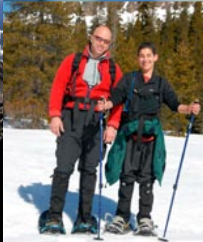
Teichert Foundation supports many organizations in which our employees are involved, one of which is Big Brothers Big Sisters of Greater Sacramento.

Teichert Foundation also makes major investments in some of the region's most valued assets including Sutter Medical Center, Crocker Art Museum, PEACE for Families Shelter, and Hospice of San Joaquin