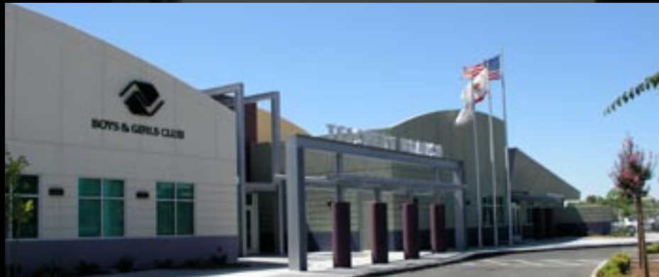
The Teichert Branch of the Boys & Girls Clubs of Greater Sacramento opened in January of 2005 in the Lemon Hill neighborhood in Sacramento.

Teichert Foundation also encourages employee philanthropy through a matching gift program. The company's commitment to public interest through funding Teichert Foundation is rooted in our belief that the prosperity of the community returns to us and to those who depend on us.